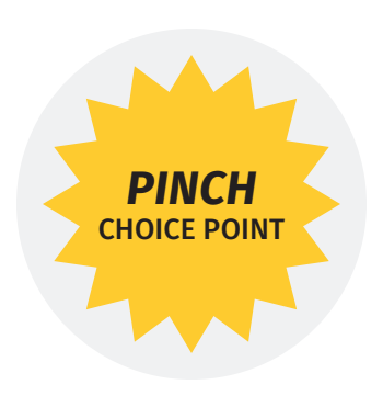
Disruption leads to a "Pinch"

Inevitably, however, situations change. The environment shifts or new information becomes available to one or both of us. In reacting to the new situation, one or both of us will knowingly or unknowingly break the other's expectations.