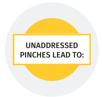
The "Pinch" as a choice point

Inevitably, there will be missed expectations. Repeated misses or a big miss will lead to a disruption in our process and our relationship. The disruption could be as simple as someone coming late to a meeting, or one person assuming the other was going to do X when they instead did Y. The disruption may come from a change in status (e.g., someone gets promoted) or personal situation (e.g., a marriage or new child) or organizational structure (a re-organization, a new manager or team member, a merger with another organization).